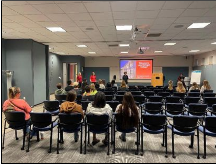
Dual Enrollment Orientation